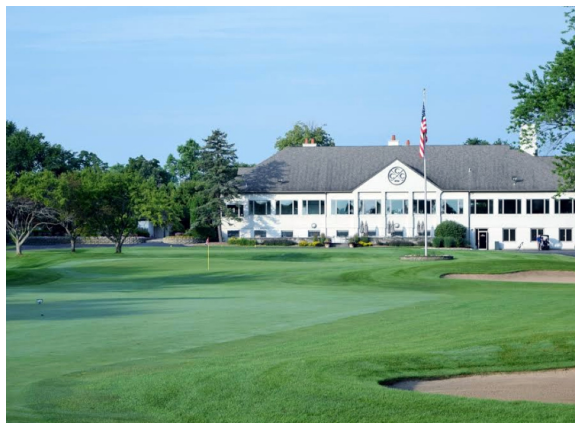
Calumet Country Club

If it closed, Calumet would be the second south suburban club to do so in short order. Lansing Country