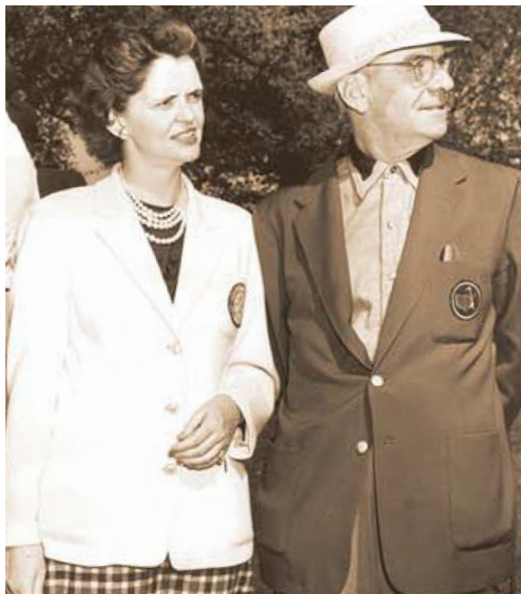
Chicago District Golf Association